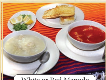
White or Red Menudo

◆ Tortilla Soup - Sliced avocados, green chile, tomato, onion, topped with tortilla strips (for chicken add 99¢, for fish add $1.99) Small: 7.79 Large: 8.79