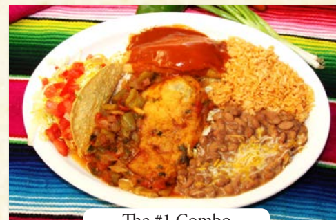
The #1 Combo

#5 - ♦ Red Beef Tamale, Two Ground Beef Tacos- 14.79