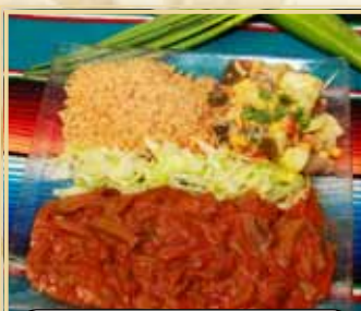
Napolitos with Red Chile