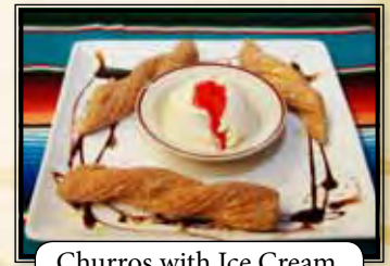
Churros with Ice Cream

Churro with Sugar and Cinnamon (It's what set the doughnut straight) with ice cream- 4.95 3 Fruit Mini Chimis (chocolate, cherry, apple, banana) with ice cream- 5.50 Sopapilla with honey and ice cream- 4.95 Flan vanilla egg custard, topped with caramel sauce- 4.95 Haagen-Dazs™ Vanilla Ice Cream Scoop - 2.50 Monster Chocolate Chip Cookie with 2 Scoops of Ice Cream- 6.00