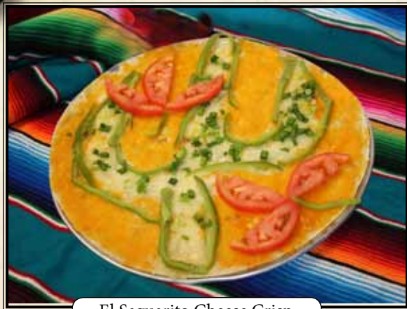
El Sagarito Cheese Crisp