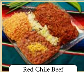
Red Chile Beef

Includes choice of 2 of the following: rice, beans, healthy whole beans, enchilada casserole or zucchini casserole