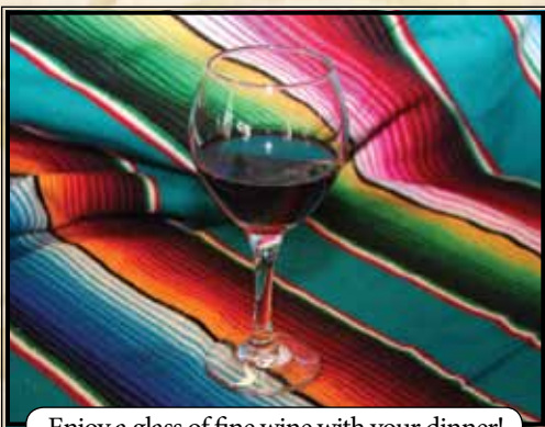
Enjoy a glass of fine wine with your dinner!

Birria Shredded beef in a southwestern vinegar based sauce- 8.99