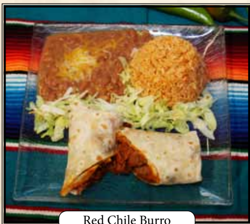
Red Chile Burro

Vegetarian Zucchini, Beans, corn, tomatoes, onions and cheese- 7.99