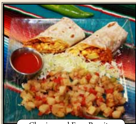
Chorizo and Eggs Burrito

◀ Chorizo and Eggs Eggs mixed with spicy ground beef - 4.25 (Shown with El Saguarito style potatoes- 2.50 extra)