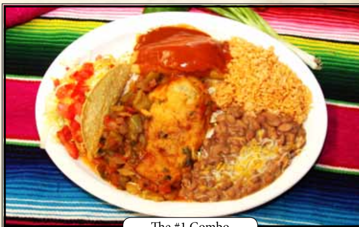
The #1 Combo

Includes choice of two of the following: rice, beans, healthy whole beans, enchilada casserole or zucchini casserole. Substitute a cheese enchilada for chicken, molida, barbacoa or mole for $1.00 ea. Substitute ground beef taco for chicken, barbacoa or mole for $1.00 ea.